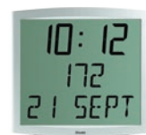
Day number or week number