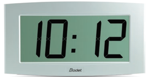
Fixed or alternating display.