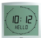
Text display 7 characters