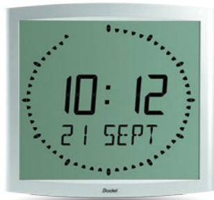
Fixed or alternating display.