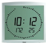
Day number and week number