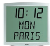
Cities' name or places' name