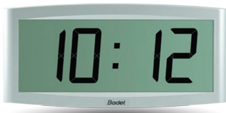
Fixed or alternating display.