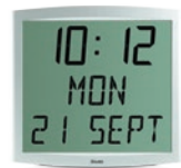
Multilingual date or numerical date