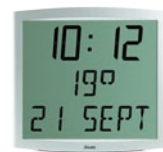
Indoor ambient temperature