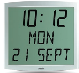
Fixed or alternating display.