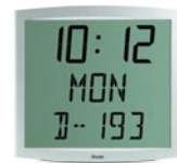
Countdown to event